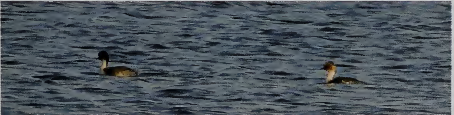
Figure 4. Silvery Grebe Podiceps occipitalis occipitalis , laguna Capirenda, near Boyuibe, dpto. Santa Cruz, July 2005; first documented record for Bolivia (J. A. Tobias)

characterised by low-stature deciduous trees, terrestrial bromeliads and columnar cacti (including Trichocereus sp.). This habitat extends to c. 2,000 m, above which grassy slopes rise to over 3,000 m.